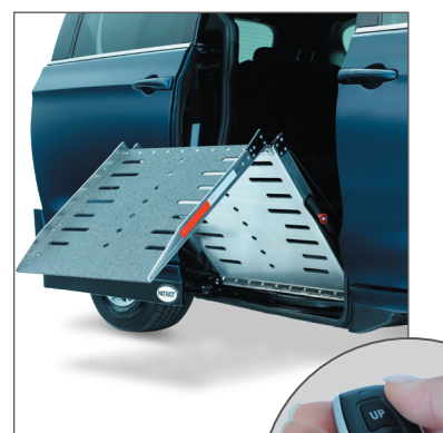
Easily Accessible A power fold-out ramp and 54 inches of dooropening height open to a spacious interior with 58 inches of headroom. The ramp is operated by an independent key fob.